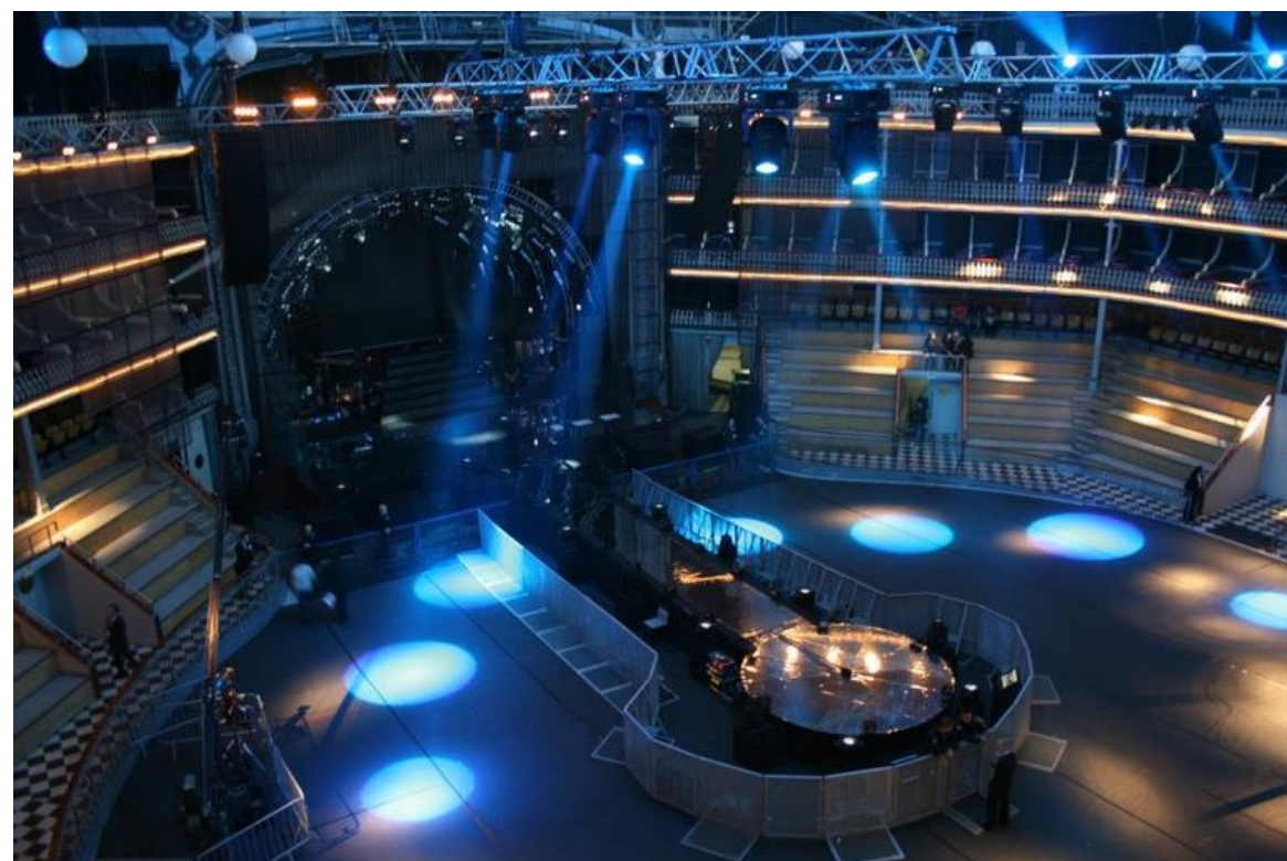
Fado Concert, Coliseu dos Recreios