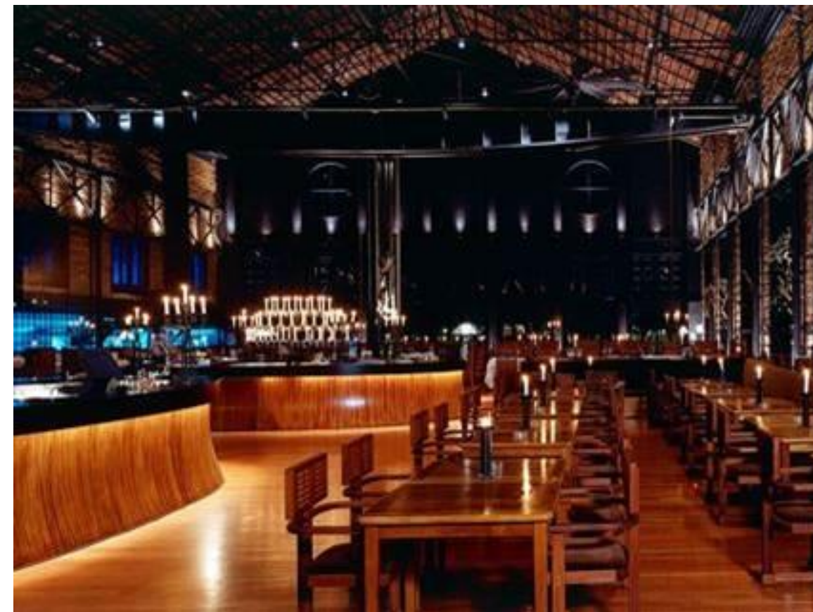
YIN party at KAIS